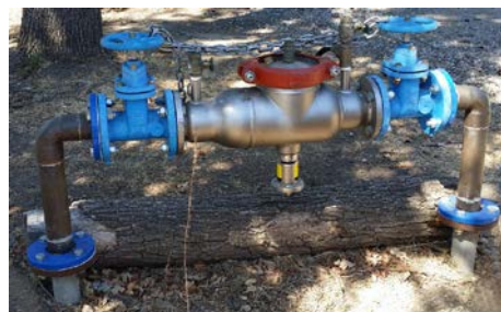
Example of a Backflow Prevention Assembly

You are responsible for arranging for annual testing of your backflow prevention assemblies by a tester approved to work in San Francisco. The tester must have a valid Permit to Operate issued by the San Francisco Department of Public Health. A list of companies employing Authorized Backflow Prevention Assembly Testers is available at www.sfdph.org/backflow .